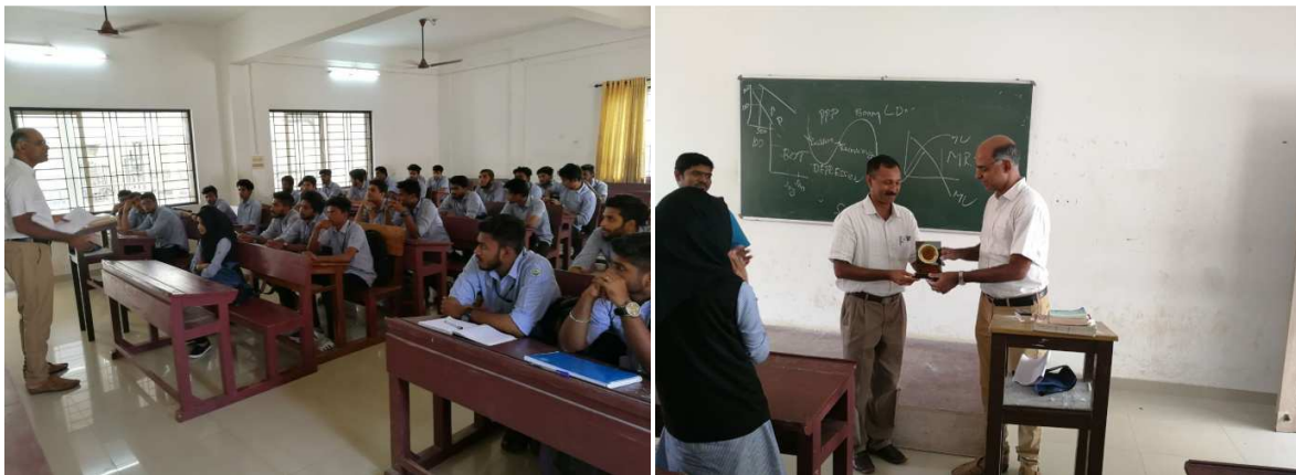
Snaps from Workshop